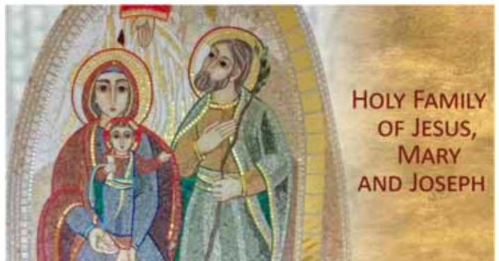
HOLY FAMILY OF JESUS, MARY AND JOSEPH

Discover more: olbsegv.org/ministry/ or contact the parish office at (847) 979-0901 or info@olbsegv.org .