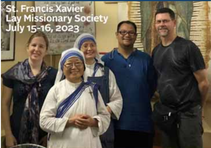
St. Francis Xavier Lay Missionary Society July 15-16, 2023

To share the Good News and help greet concert goers, please sign up here: signupgenius.com/go/4Jul23ConcertAmbassador