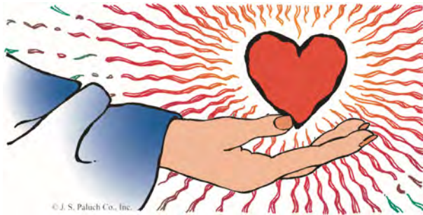
© J. S. Palach Co., Inc.

Our Lady of the Blessed Sacrament Parish OLBSEGV.org (847) 979-0901 | info@OLBSEGV.org Follow us on Facebook @olbsegv.org